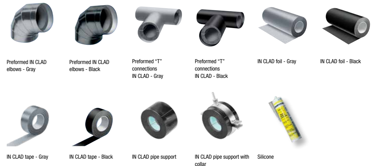
Preformed IN CLAD elbows - Gray